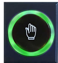
Green light indication during induction