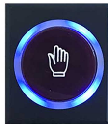
Blu-ray indication during standby